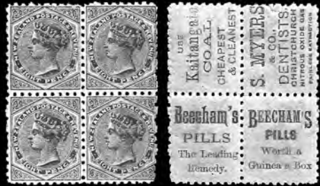
1679 (both sides)