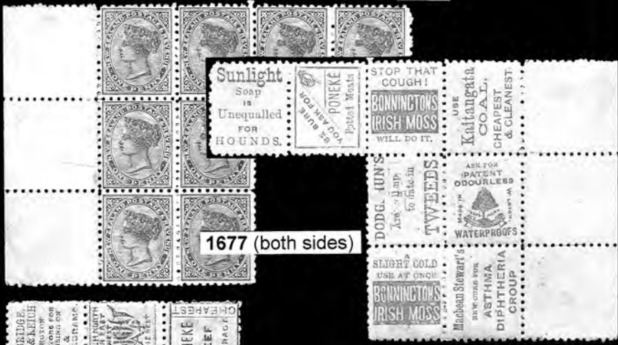
1677 (both sides)